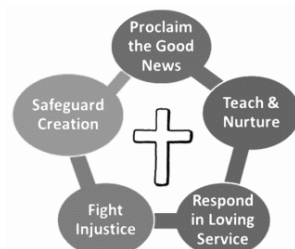
Our Five Marks of Mission

It is not a case of "Why don't they?" but "Why don't we? Let us..." for all Christians are in the front-line representing Jesus.