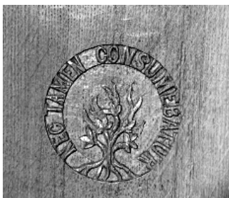
Carving on back of Minister's chair