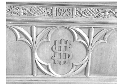
Communion Table at Dunbarney Church